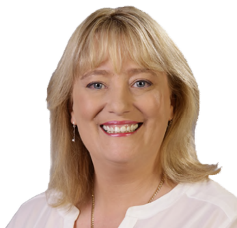
The Hon. Ros Spence MP Minister for Prevention of Family Violence

In the reporting period, Minister Spence was the Minister for Prevention of Family Violence. Minister Spence was also Minister for Community Sport and Minister for Suburban Development during the reporting period.